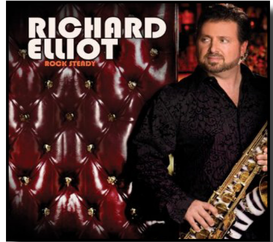
Smooth Single No. 1: Richard Elliot Move On Up (Artistry/Mack Avenue)