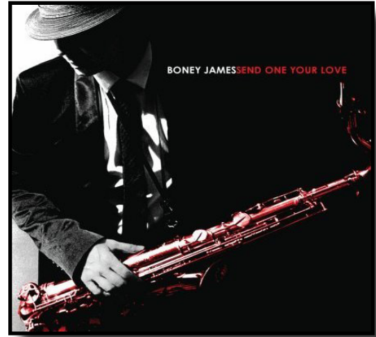
Smooth Album No. 1: Boney James, Send One Your Love (Concord)