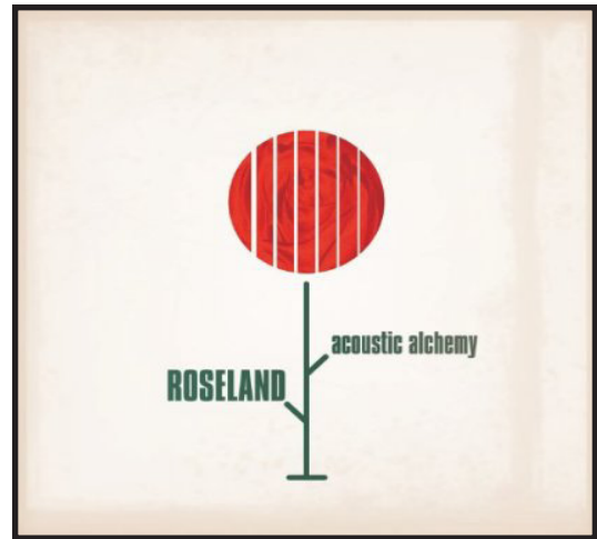
Smooth Single No. 1: Acoustic Alchemy, "Marrakesh" (Heads Up)