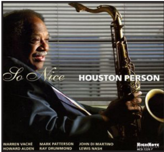
Jazz Album No. 1: Houston Person, So Nice (HighNote)