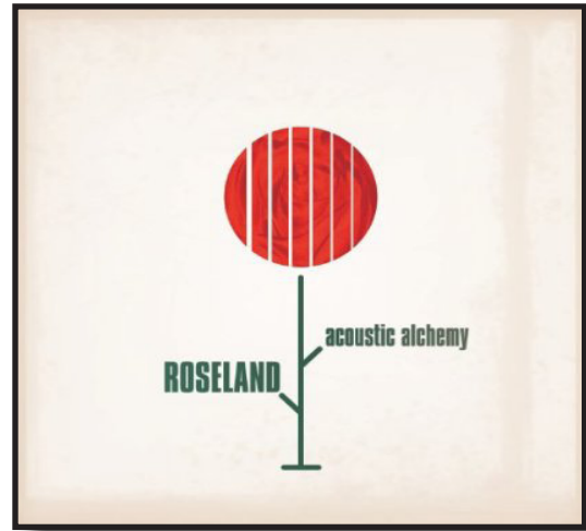
Smooth Album No. 1: Acoustic Alchemy, Roseland (Heads Up)